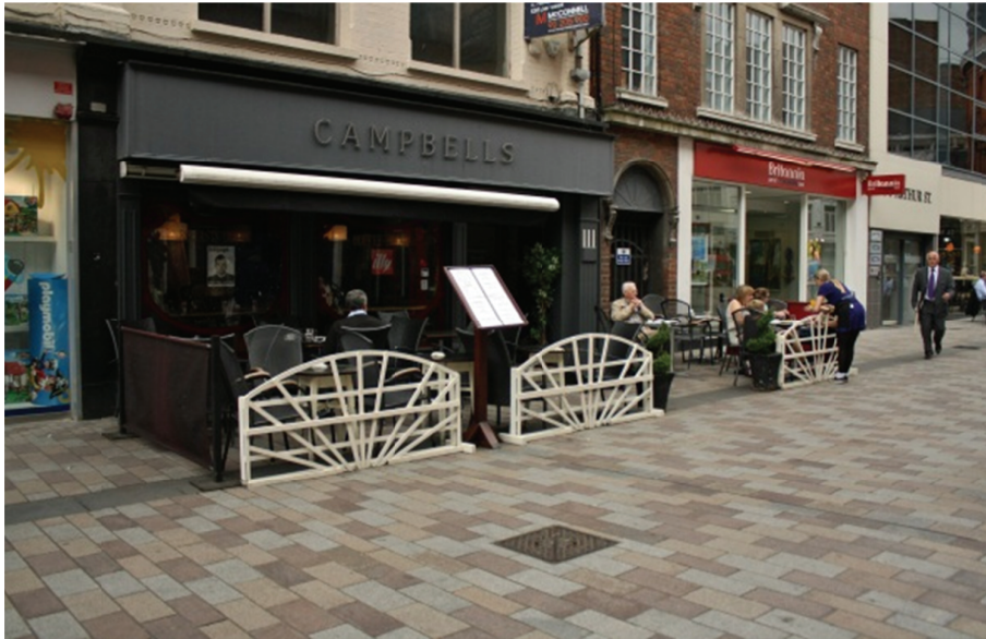
Attractive screened off café in pedestrianised area