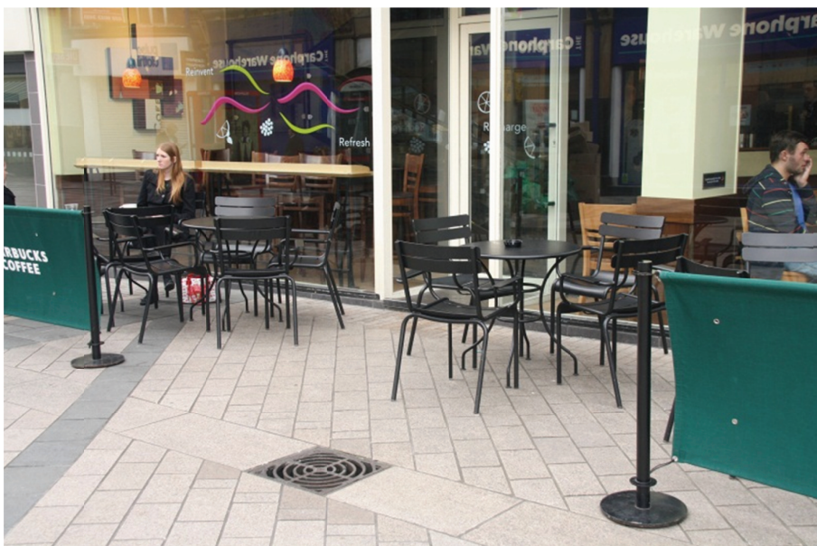
Poor example of screening. Screening although secured to the pole is too loose making detection with a long cane inconsistent. Screening stops short of seated