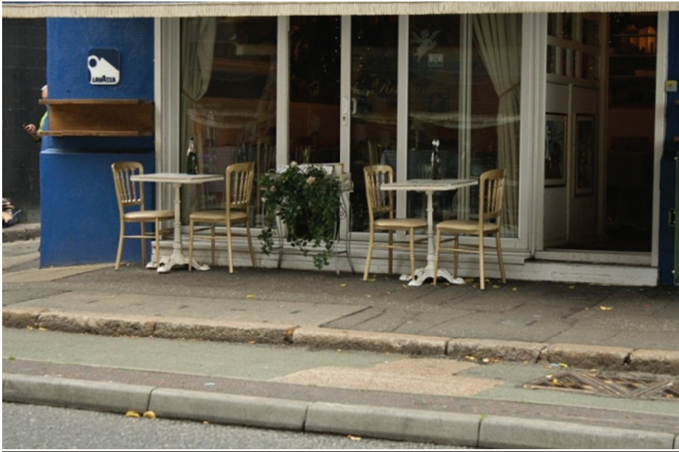
Unscreened café in side street