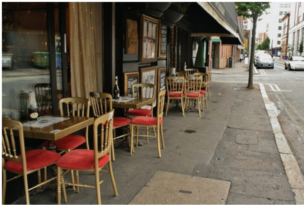
Unscreened café in side street