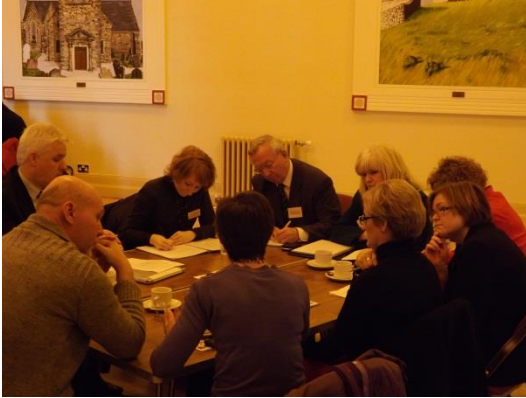
Stakeholder event on Transforming Your Care and health inequalities experienced by people with a learning disability: 2012