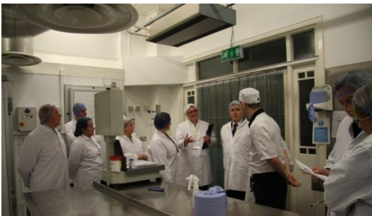
Committee Members attending a food hygiene inspection to inform their scrutiny of the Food Hygiene Rating Bill