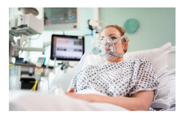
Image 5: shows a patient trialing the new CPAP device at UCHL<sup>41</sup>