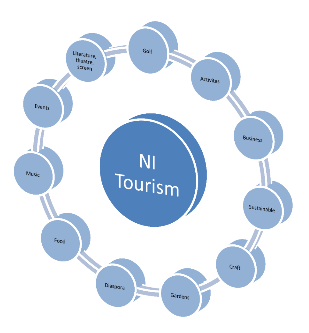
Figure 1: Tourism sectors – as defined by Tourism NI