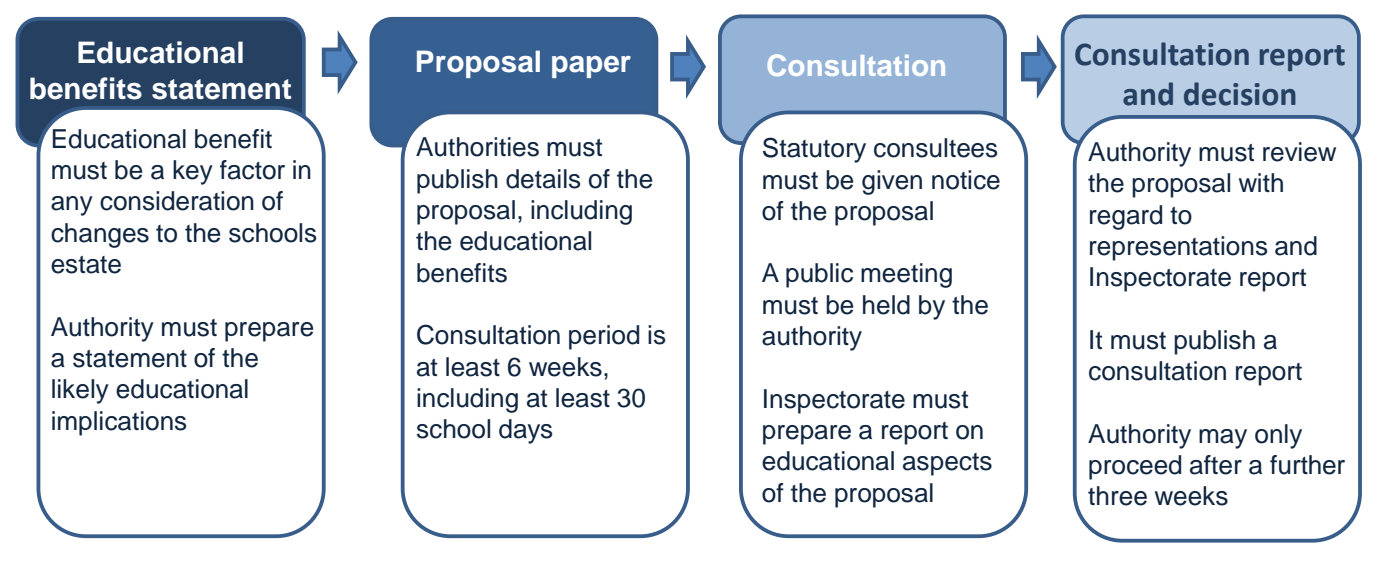
Figure 2: Overview of consultation procedures for changes to Scottish schools

The legislation revised the consultation process for all school closures and other significant changes to schools, aiming to make the process more open, rigorous and transparent.<sup>6</sup>