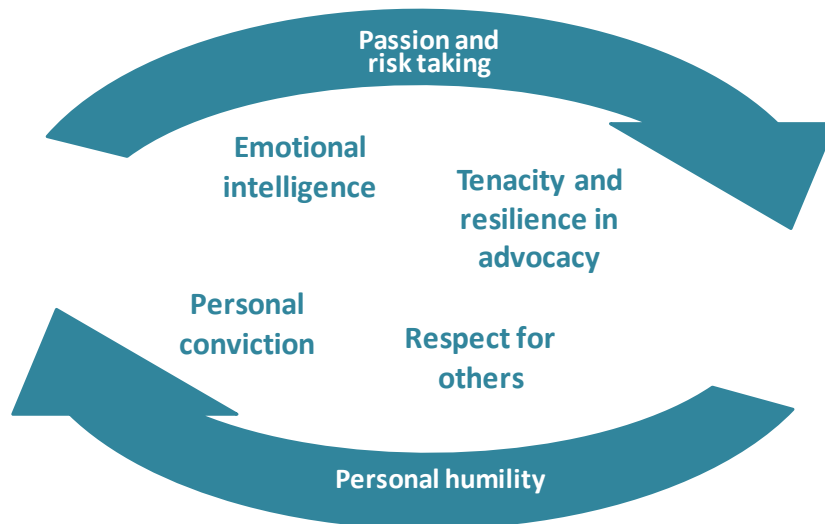
Figure 2: Key characteristics of headteachers of schools in challenging circumstances