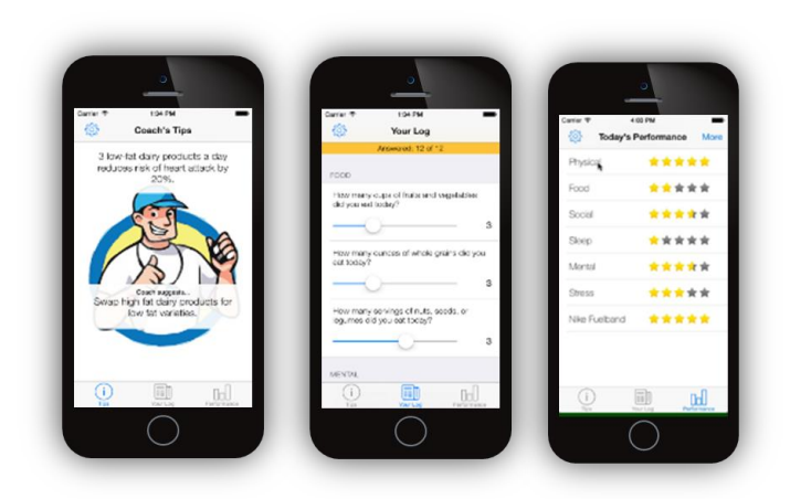
Figure 1 The Gray Matters app used during the study's RCT.

This previous research was the foundation for a successful collaboration between Utah State University (USU) and Ulster University (Ulster) through the Gray Matters Study (Figure 1) (Norton 2015, Hartin 2015). This study is an evidence-based multi-domain lifestyle intervention for middle-aged persons (40 to 64 years) with normal cognition, designed to promote brain health.