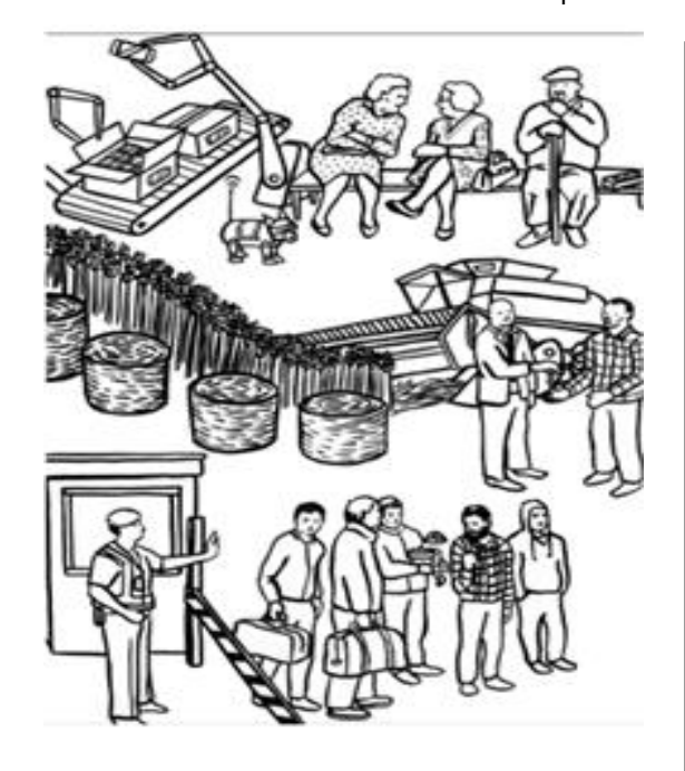
Example of scenario image and text used

GREY AUTARKY: EU systems have either gone or become disempowered, and because the Common Agricultural Policy is no longer in place and subsidies have been cut, there have been some job losses in this area. This has precipitated a drastic shift in how agriculture in Ireland works, for example with a reduction in the amount of livestock farming. There is more self-sufficiency and self-provisioning in the food system and food chains become more localised. The food system is considered to be more resilient as a result and the environmental impact of Irish agriculture has decreased dramatically, specifically because of a move away from animalbased monocultures to smaller-scale diversified operations. Much land is being left fallow, in particular marginal lands such as flood plains. This has resulted in an increase in biodiversity. There has been a reversion to diets which are largely based on local food production. The economic flux in this sees many young people emigrating and the loss of young people in rural areas hinders rural social innovation.