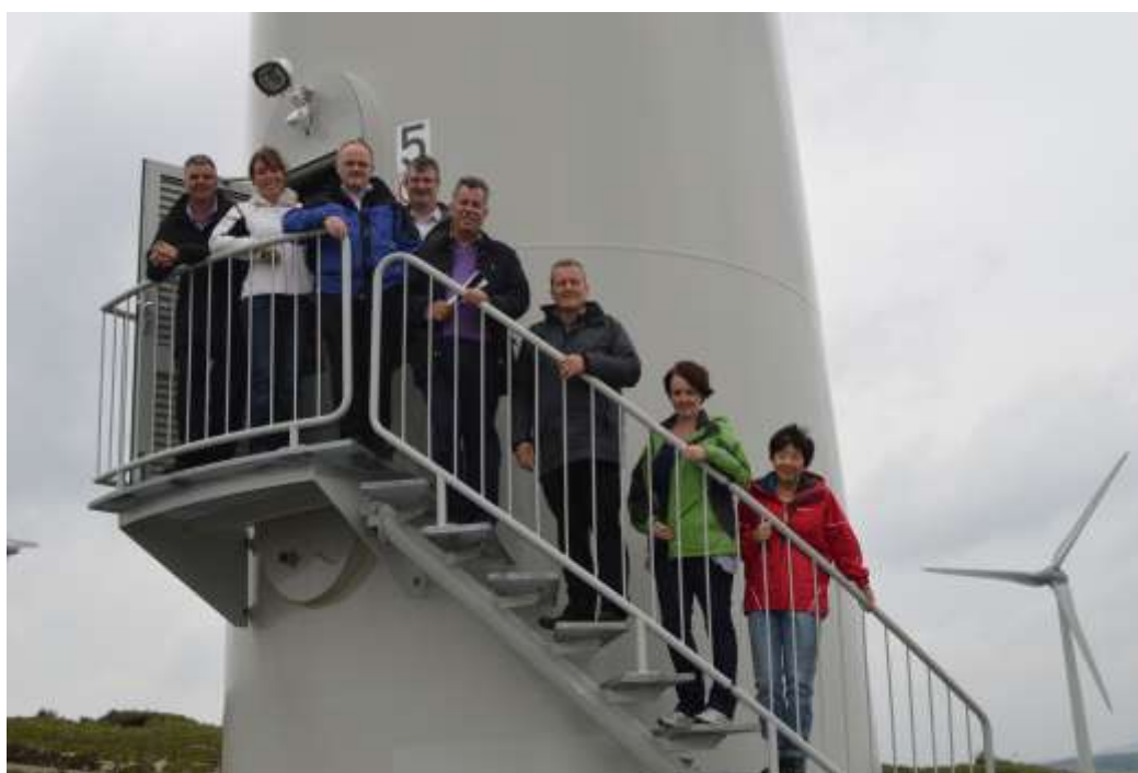
Committee members visit a wind farm at Crighshane, Co Tyrone, in June 2014

As part of the Inquiry the Committee visited Crighshane Wind Farm site, and the adjacent sub-station, to gain an understanding of how power is produced; the Committee also visited local residents and heard their concerns at first-hand.