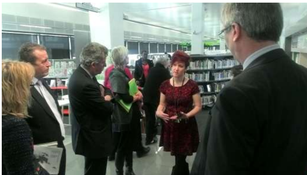
Members discussing the facilities at Craigmillar Library and Community Hub with an official from Edinburgh City Council in March 2014

community and voluntary sector; and a visit to an area of Edinburgh (Craigmillar) where issues of deprivation and social exclusion are being addressed through community planning.