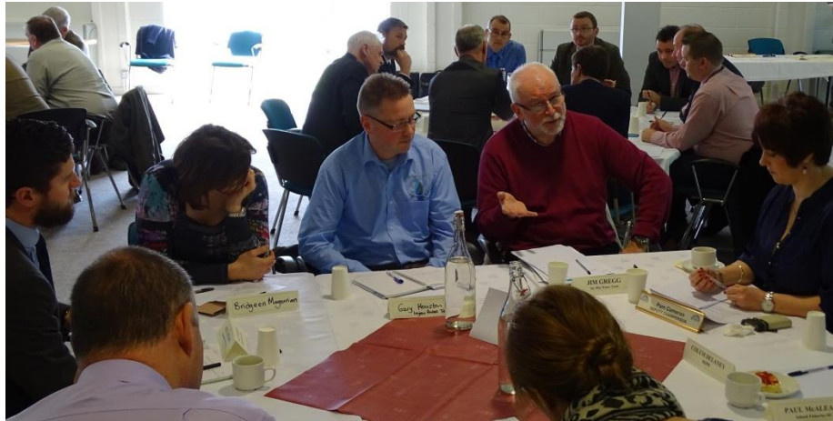
Discussion group at river pollution stakeholder event