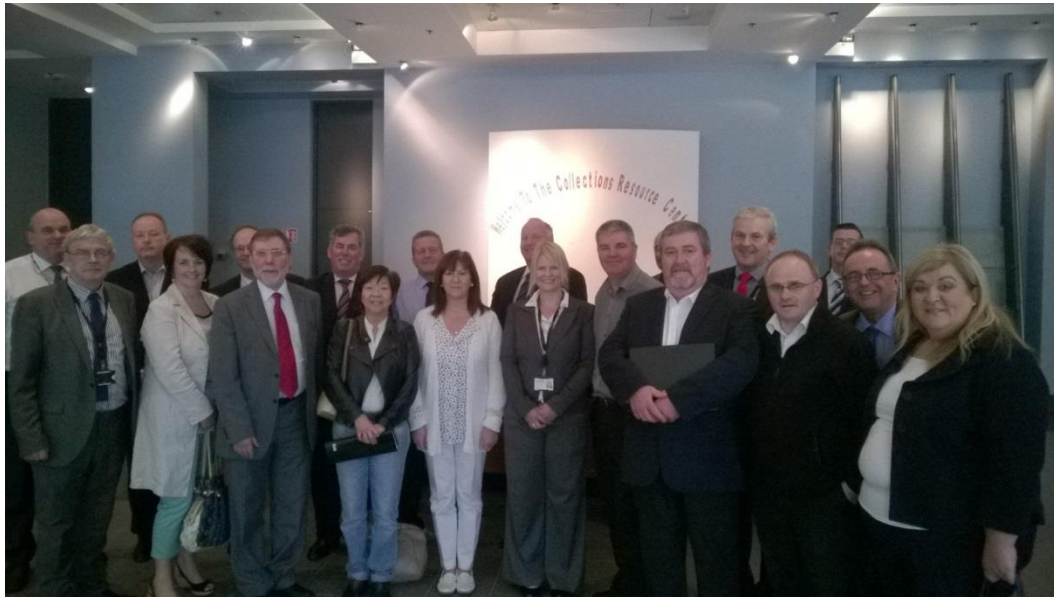
Committee members along with members of the Committee for Culture, Arts & Leisure visiting Swords Collections Resource Centre, National Museum of Ireland