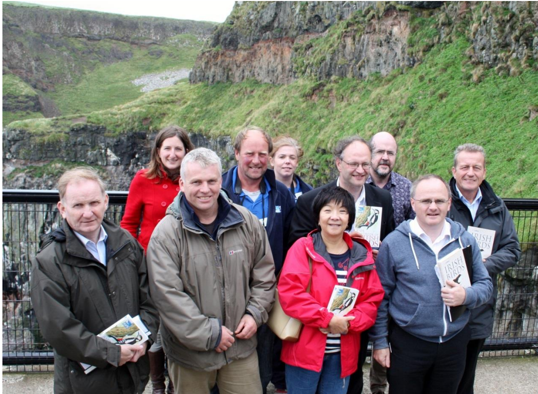
Committee members on visit to the RSPB Seabird Centre, Rathlin Island