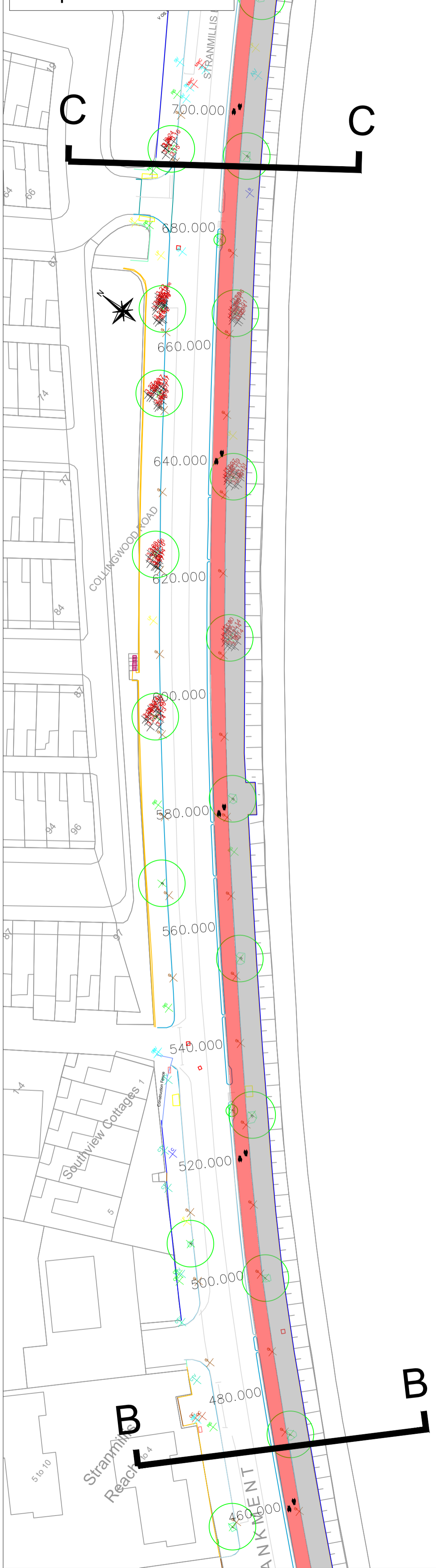
Viewport C Scale 1:500