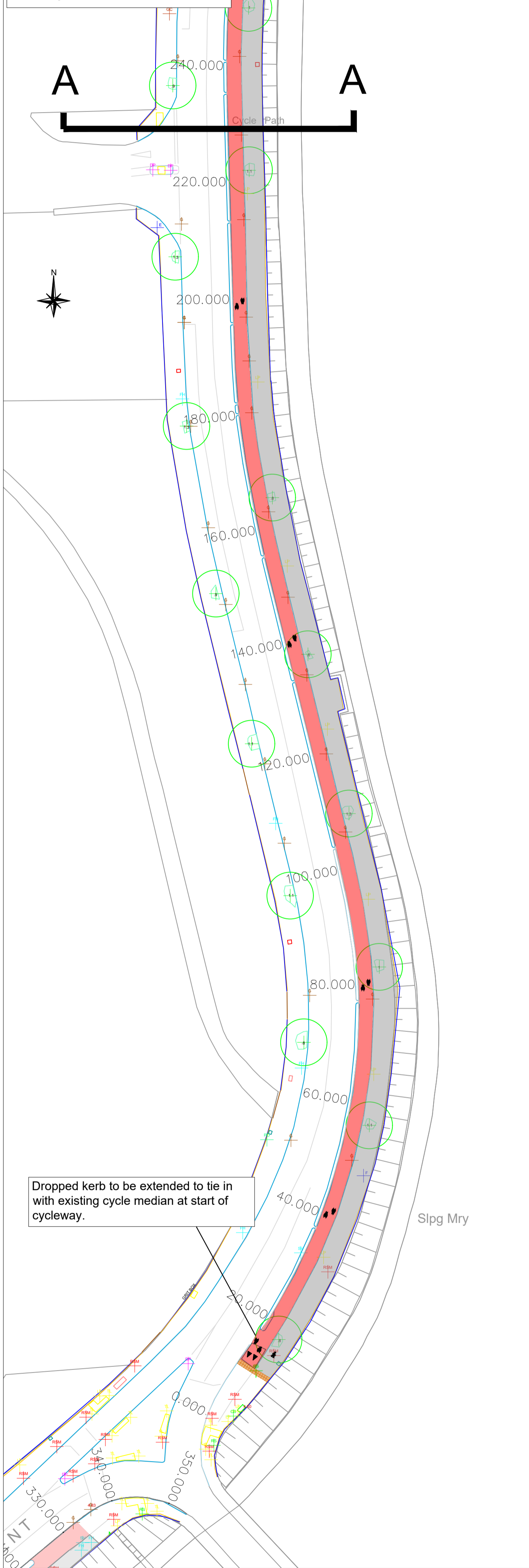
Viewport A Scale 1:500