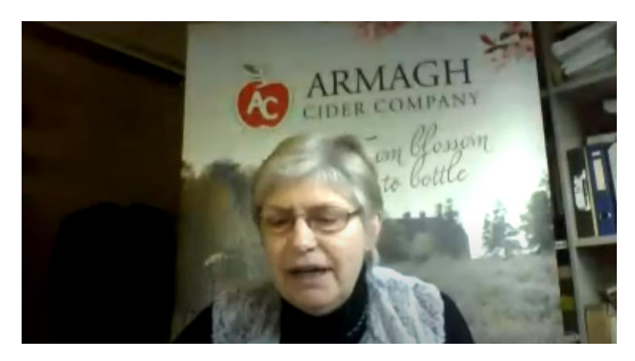
Evidence session with local producer - Armagh Cider Company