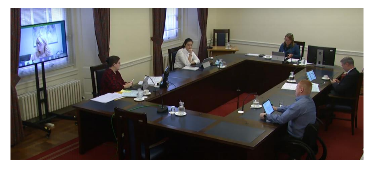
Committee at work in hybrid meeting