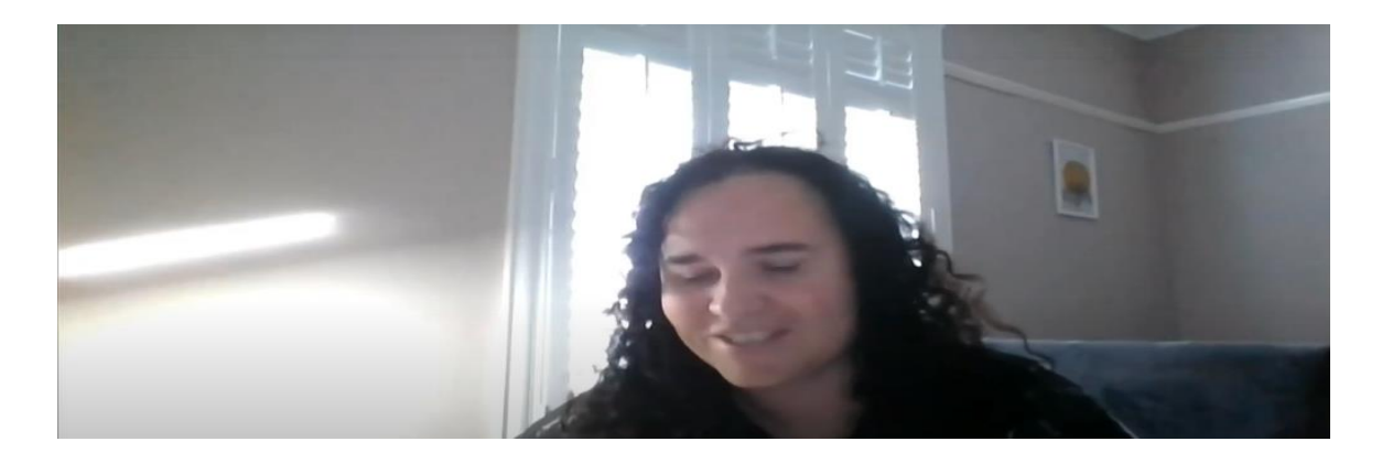
RalSe presentation on the Private Tenancies Bill

professionals, but that the sector also houses a considerable number of vulnerable households.