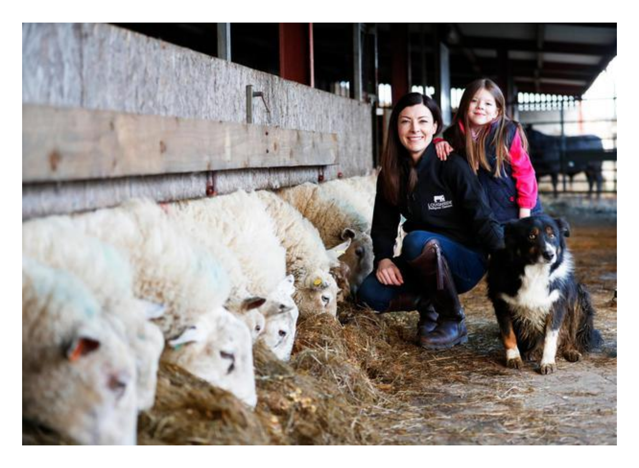
Women in Northern Ireland Farming - Belfast Telegraph