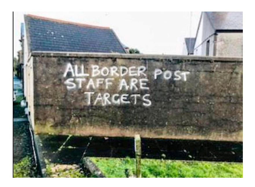
Increased Reports of Concerning Activity 29 January- 1 February 2021