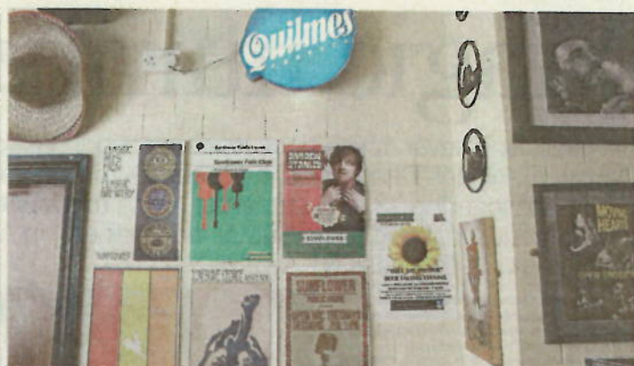
Sunflower Public House has become a great destination for arts lovers since its collaboration with the Cathedral Quarter Arts Festival, a worthy winner at the Allianz Arts & Business NI Awards.