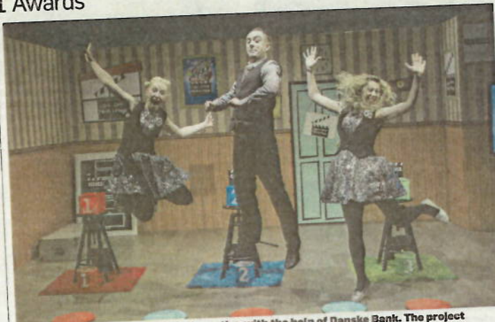
Cahoots NI performers put fun into maths, with the help of Danske Bank. The project won the Sustained Partnership Award at the 2014 Allianz Arts & Business NI Awards