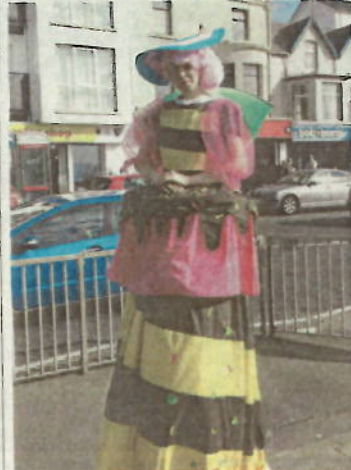
A performer at the Big Telly Theatre Company festival day in Portstewart, winner of the Allianz Arts & Business NI Community Art Prize