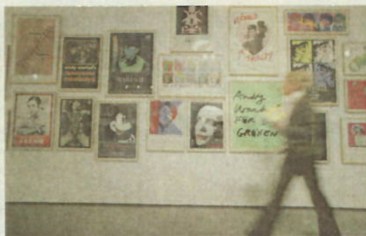
The Andy Warhol exhibition at the MAC, which was supported by Ulster Bank, Deloitte and ABSOLUT, and shortlisted at the 2014 Allianz Arts & Business NI Awards