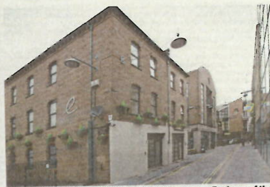
Edwards & Co's offices in Belfast. The company won Business of the Year Award at the 2014 Allianz Arts & Business NI Awards.

Edwards & Co was also shortlisted in the Employee Engagement Award category for its partnership with Happenstance Theatre.