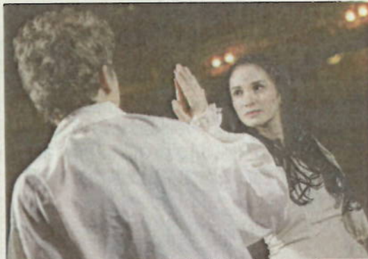
Above and below: Actors perform in c21 Theatre Company's production of Romeo & Juliet, which was supported by Burke Shipping Company and shortlisted at the Allianz Arts & Business NI Awards