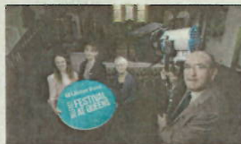
Shining a light on some of the world-class local talent celebrated at the 2013 Ulster Bank Belfast Festival at Queens.