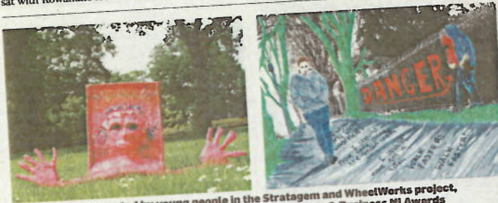
Some of the art created by young people in the Stratagem and WheelWorks project, winner of the Young People Award at the 2014 Allianz Arts & Business NI Awards