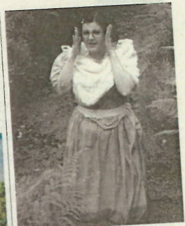
Top: An actress performs as part of the Rowallane Plays. Left: Rowallane Garden, the chosen location for a project between Herbert Smith Freehills and the National Trust, winners at the Allianz Arts & Business NI Awards.