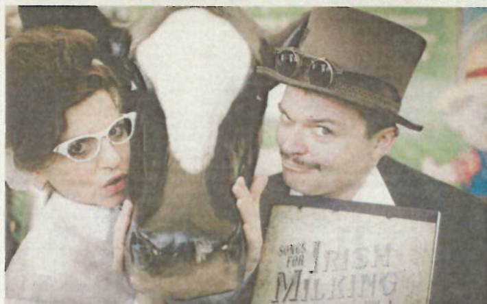
Above, top left and right: Performers of Kabosh's Inventors, which was supported by Ulster Bank and shortlisted at the 2014 Allianz Arts & Business NI Awards

concerts in Belfast, aimed at older people who couldn't make it out at night. After five seasons, 25,000 plus people have attended the concerts.