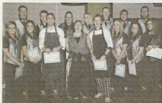
Staff at Caffé Fresco after the hugely successful employee engagement and arts event

When Caffé Fresco decided to undertake an employee engagement exercise, the restaurant threw itself completely into the arts, boosting staff morale and winning the Employee Engagement Award at the Allianz Arts & Business NI Awards in the process