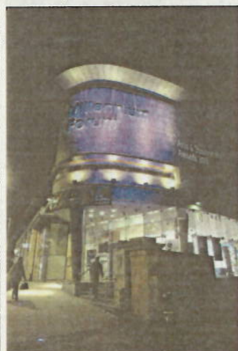
Millennium Forum, winner of the Arts Award at the 2014 Allianz Arts & Business NI Awards

The InterAct Youth Arts Festival, a joint venture with the Youth Forum, sees inclusive youth arts activities including workshops,