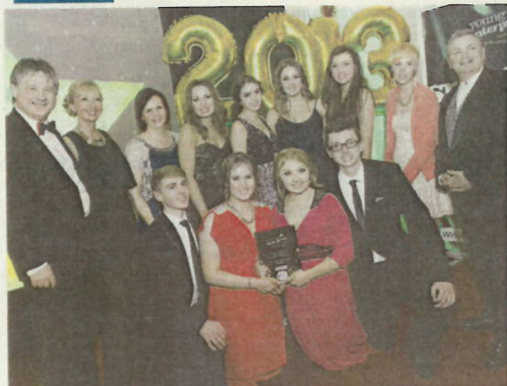
The Wallace High School, Lisburn team sparkles at the Young Enterprise Business competition final in London