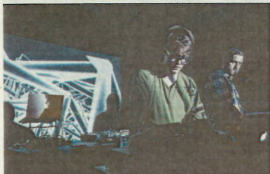
Ghosts perform at a Distillation event, held by Oh Yeah Music Centre in association with Bushmills. The partnership was shortlisted at the Allianz Arts & Business NI Awards