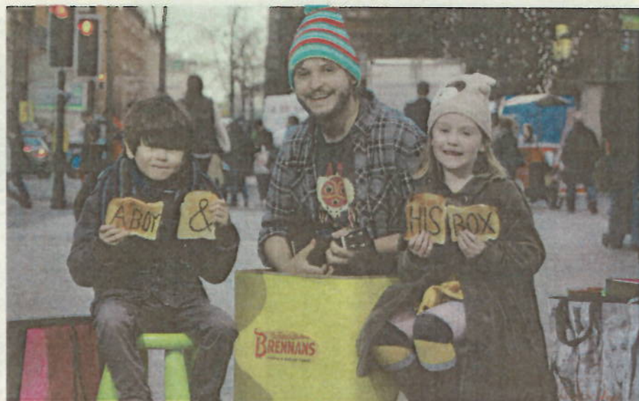
The launch of A Boy & His Box, a Replay Theatre Production supported by Brennans. The partnership was shortlisted at the 2014 Allianz Arts & Business NI Awards

In December 2013, it announced it would sponsor the project for a fourth year, with