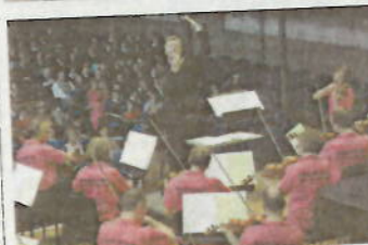
Top: Members of Ulster Orchestra and local schoolchildren launch Planet Earth. Bottom: KS2 pupils enjoy the event, which was sponsored by AES, winner at the 2014 Allianz Arts & Business NI Awards.

brand awareness, CSR and communications." Indeed, the firm has had a fantastic journey into the arts world. After the initial Ulster Orchestra engagement, it linked up with Cahoots NI for a magic workshop. Fifteen AES employees