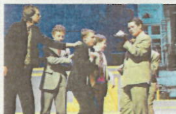
Grand Opera House youth productions, which were sponsored by The Co-operative, a partnership that was shortlisted at the 2014 Allianz Arts & Business NI Awards

that will enhance their lives "because they are our customers and employees of the future".