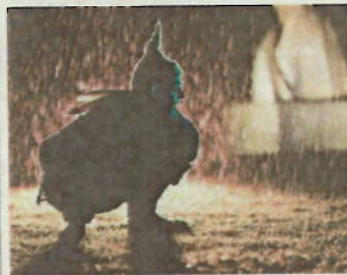
Belfast Circus Community School engages young people in the creative learning process

buzz in the town. We had street performers everywhere, and shops that wouldn't normally open on a Sunday presented special events. The hairdressers did 1920s hairstyles, and beauticians