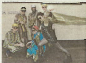
Performers launch the Cathedral Quarter Arts Festival, which has been recognised, along with the Sunflower Public House, at the 2014 Allianz Arts & Business NI Awards