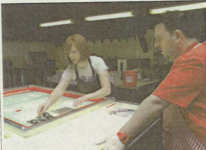
Employees from AV Browne work on their designs at Belfast Print Workshop, a project shortlisted in the 2014 Allianz Arts & Business Awards

In return for the workshops, AV Browne worked with Belfast Print Workshop staff to create a new brand identity for the membership organisation. Workshop staff members were brought into the agency's office and saw the whole creative and selection process in action.