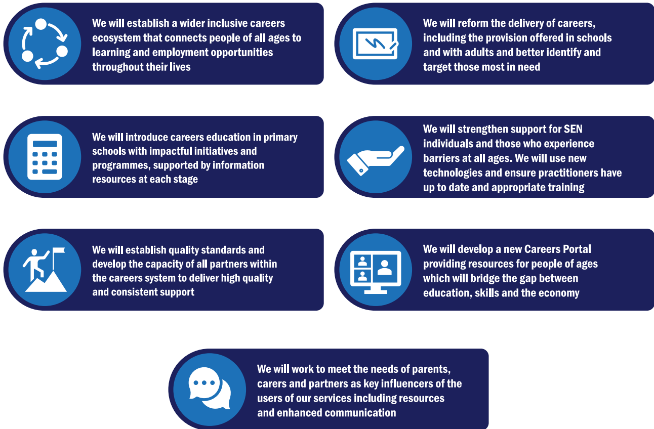
Figure 3: Careers Action Plan Vision