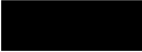
The Rainbow Project