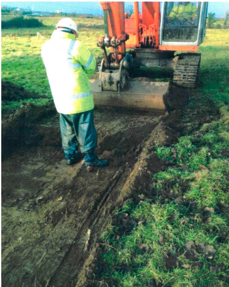
Watching brief. The excavation work must meticulously remove small layers of soil to check for both cross-cutting of the land by a grave or any evidence of human skeletal remains.