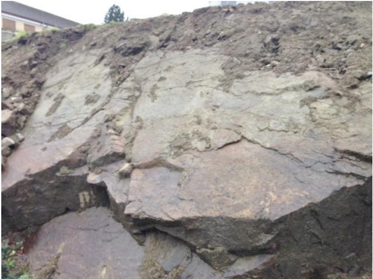
Geology of Marionvale Phase One

From: [REDACTED] Sent: 17 November 2025 11:38 Subject: Marionvale Mother and Baby Home Response