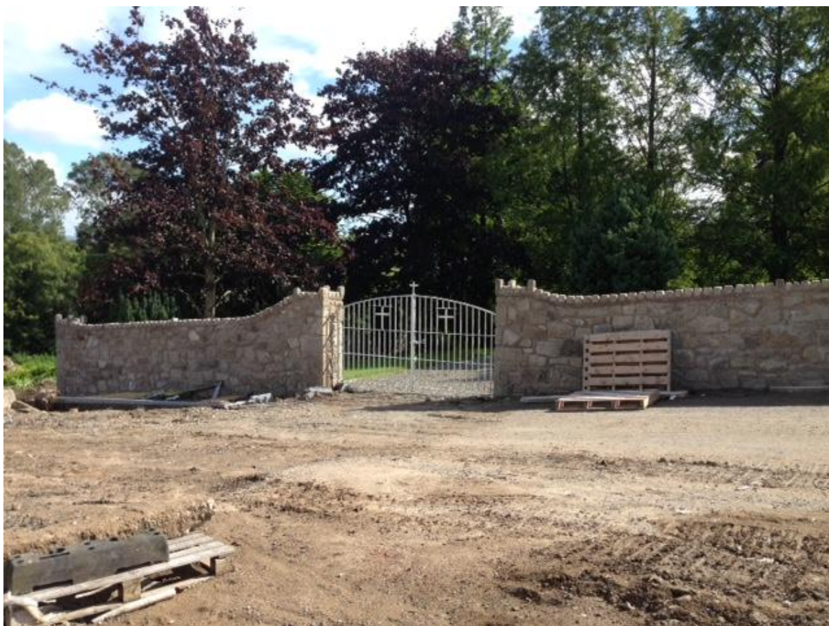
New wall and entrance around the post-Mother and Baby cemetery for Marionvale.