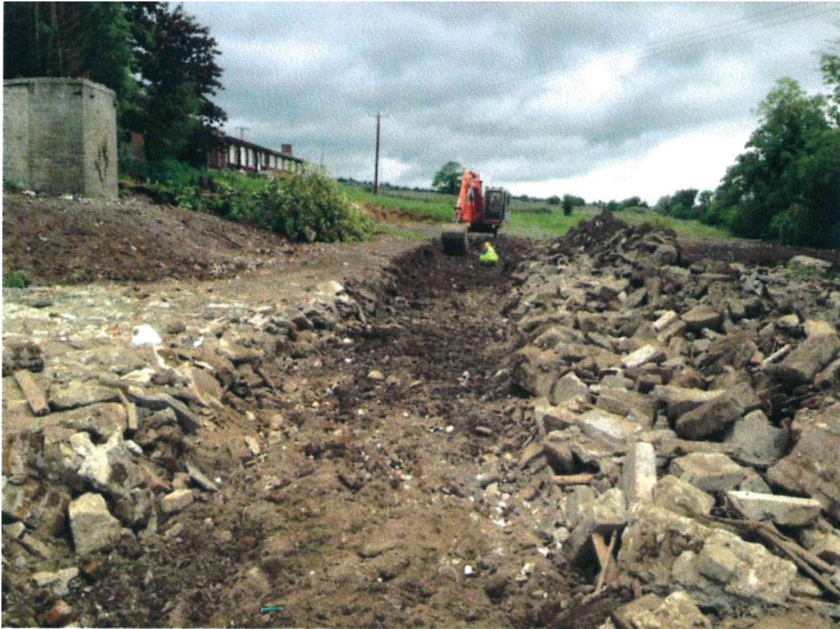
Clearance for testing of the image above - Note an archaeologist was constantly walking with the digger.