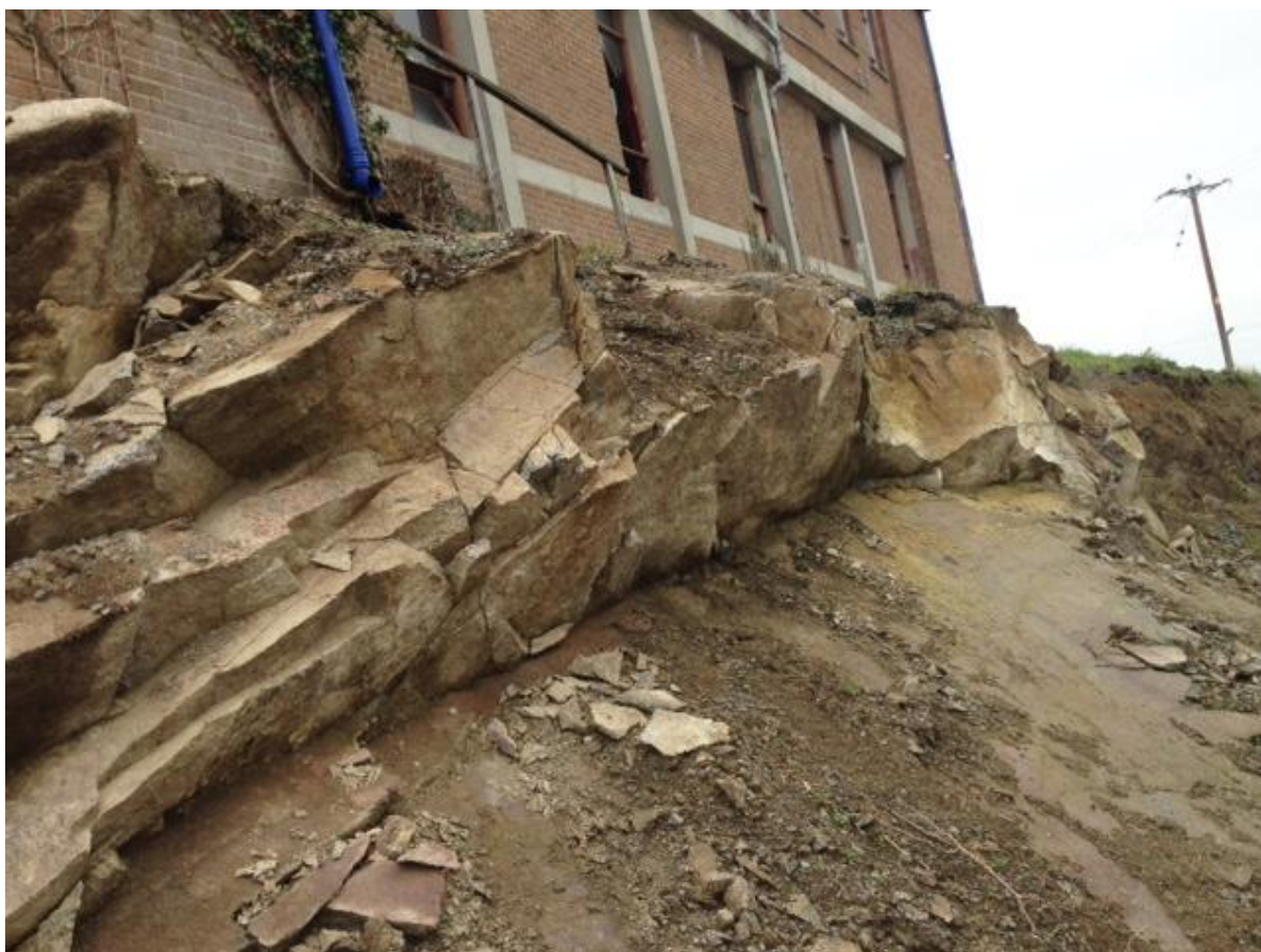
Geology of Marionvale Phase one