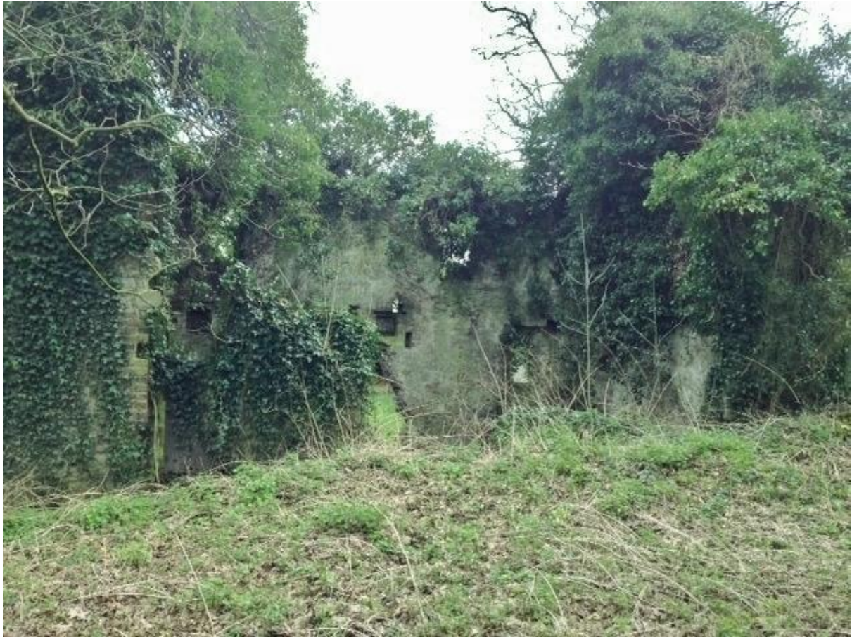
The abandoned Spade Mill close to Marionvale Site