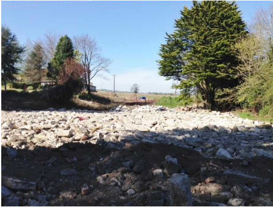
The demolished pig-pens were scattered across the area of potential infant burial at Marian vale This. Material had to be carefully removed under constant supervision.