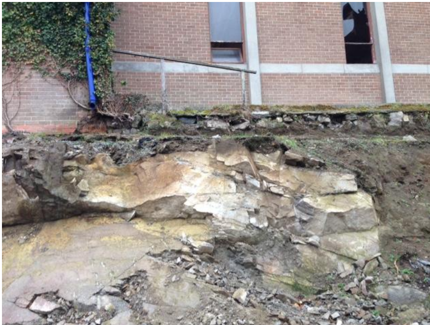
The underlying geology of the Marian vale site, there was no more than 20cm of soil over solid rock.- Burial was not possible.