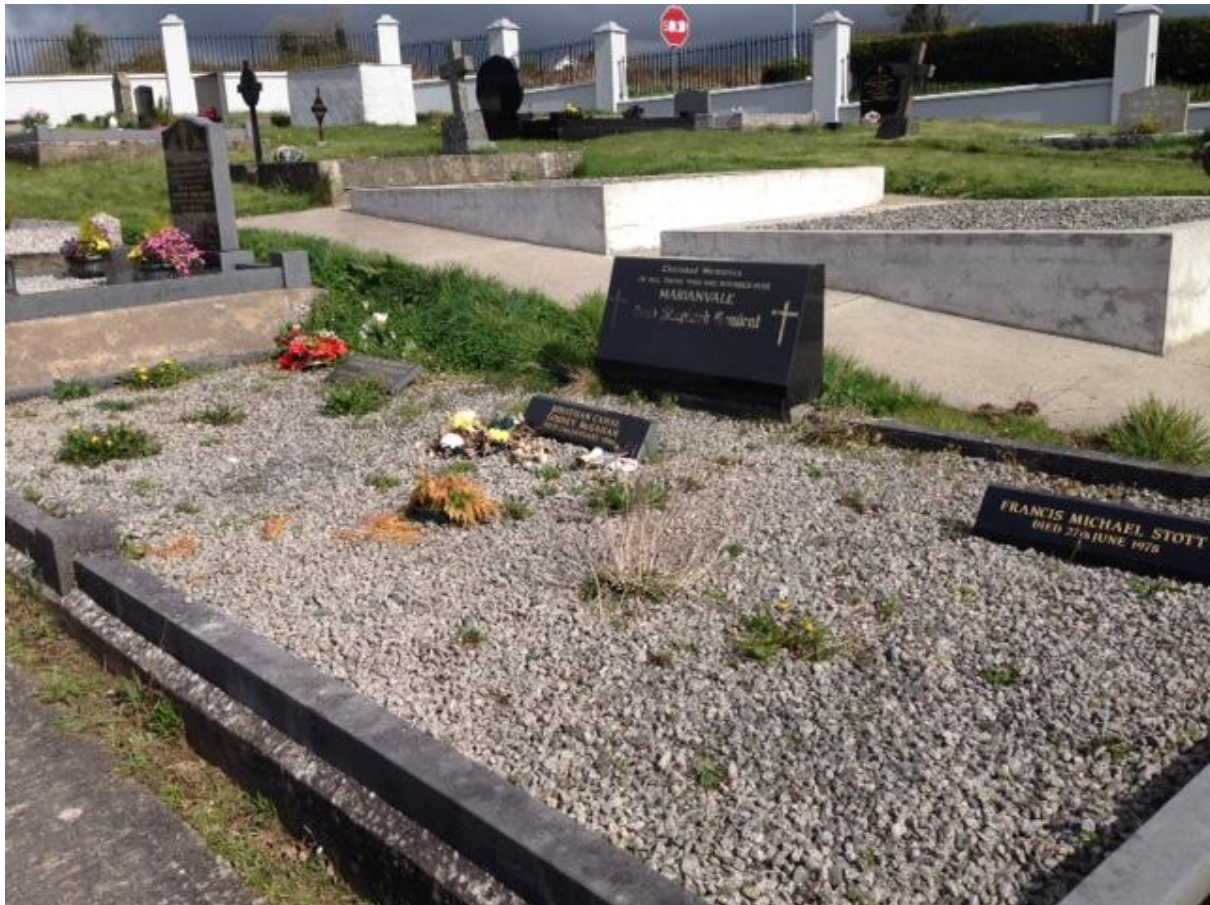
Marionvale grave at Carrickcruppen Cemetery