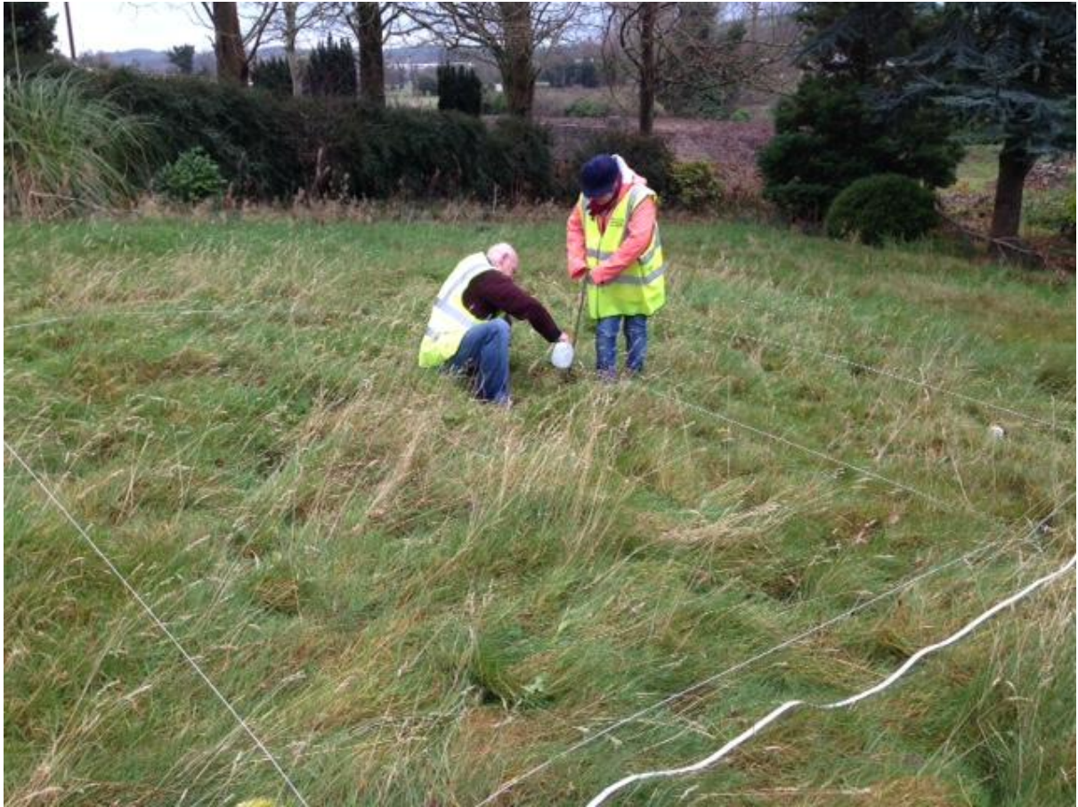
My team marking out a grid for testing in the garden of Marionvale