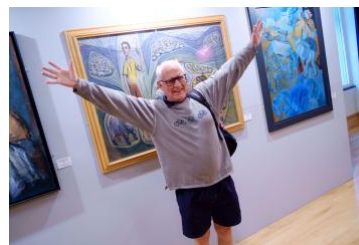
An Arts Ambassador in the Braid's exhibition of the Methodist Art Collection

Arts Ambassador (4) for Methodist Art Collection, Creative Citizens, 2015