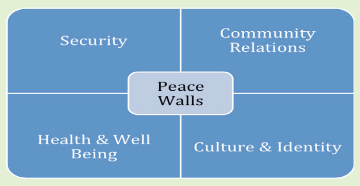
Figure 1: Framing the issue of peace walls through thematic policy analysis

It is true that the devolved administration at Stormont and local government at council level have already recognized the significance of the walls and have incorporated the issue into broader strategies, policy frameworks and action plans designed to deal with the wider problems of segregation, community safety and urban regeneration. For example, the Northern Ireland Executive's Programme for Government 2011-15 commits to 'actively seek local agreement to reduce the number of peace walls'. In addition, the Cohesion, Sharing and Integration (2011) document published through the Office of the First Minister Deputy First Minister (OFMdFM); the Department of Justice's Building Safer, Shared, and Confident Communities (2011) document; and the Belfast City Council's Investment Programme: 2012-2015 consultation document each place an emphasis on the issue of segregation, interfaces and peace walls. Furthermore, the International Fund for Ireland (IFI) recently announced a £2 million investment in its Peace Walls Programme, to support confidence and relationship building initiatives across interface communities. Belfast City Council has also committed £421,000 to support its interface programme