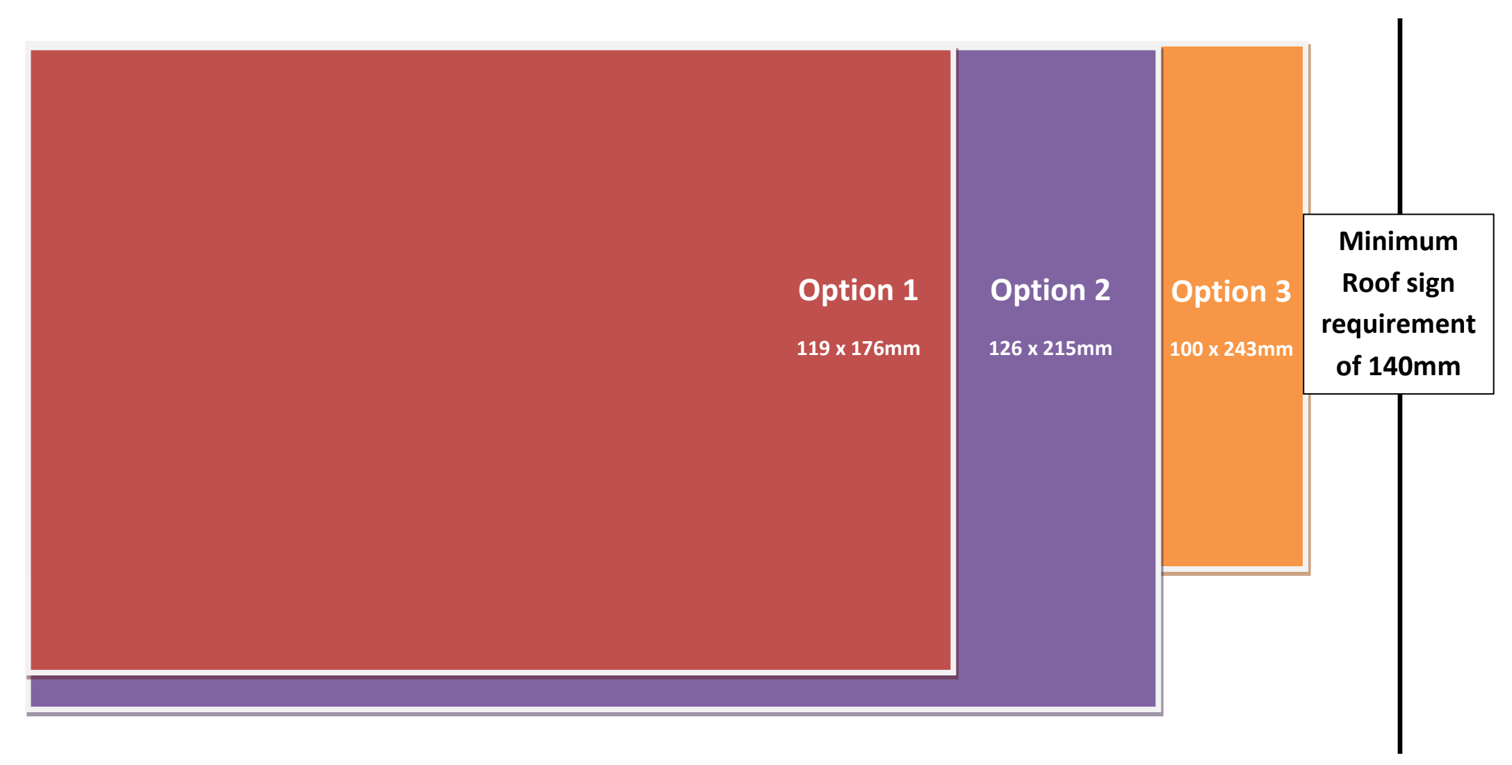
ANNEX 1 PLATING OPTION SIDE BY SIDE COMPARISON