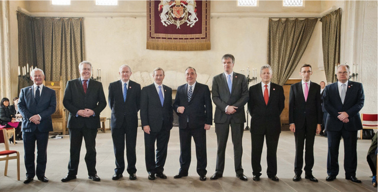
The heads of delegations were welcomed by First Minister, Rt. Hon. Alex Salmond MSP.