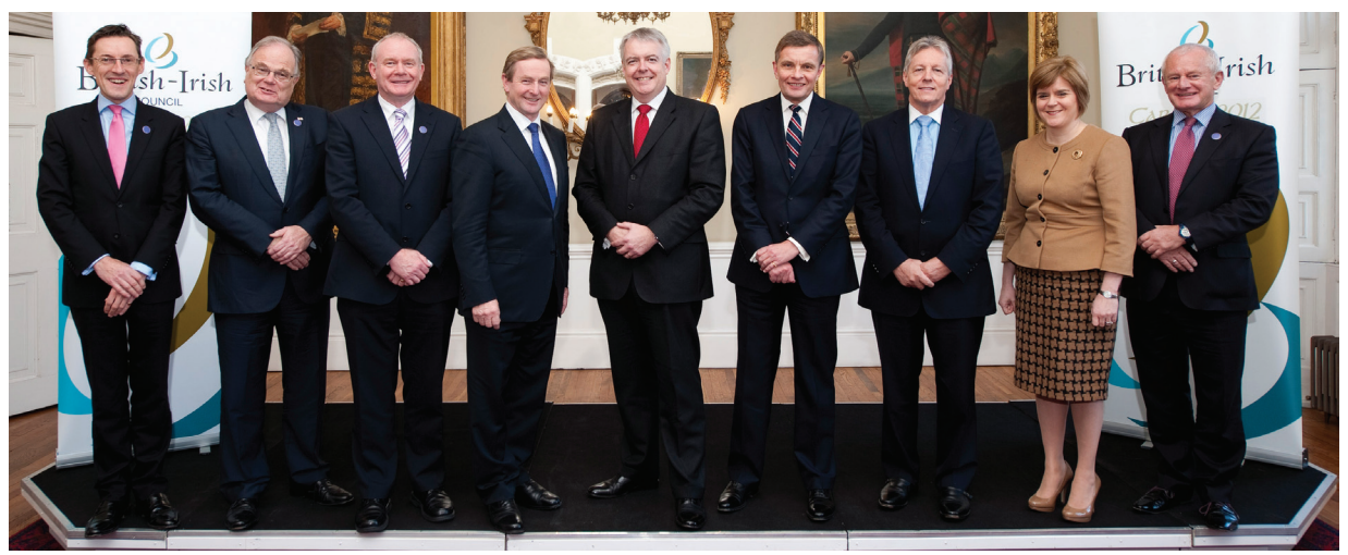
The heads of delegations were welcomed by First Minister, Rt. Hon. Carwyn Jones AM.

The principal delegates at the British Irish Council Summit, Cardiff, Wales - November 2012.