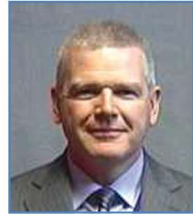
The Clerk / Director General

In our Equality Scheme we set out how the Northern Ireland Assembly Commission (Assembly Commission) proposes to continue to fulfil the Section 75 statutory duties.