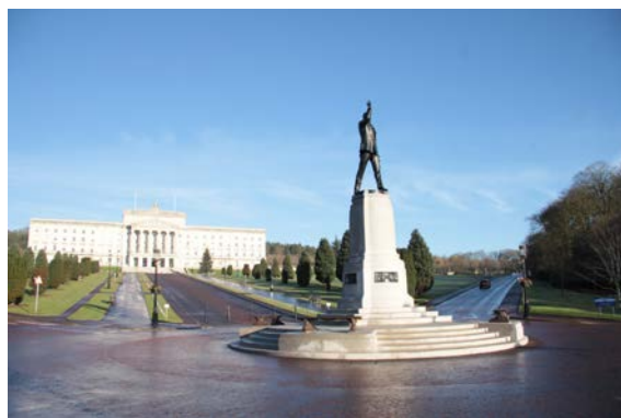
Roundabout at Carson's Statue

After passing through the barrier, continue up the hill to the roundabout with the statue of Sir Edward Carson in the centre. Carry on past this roundabout heading towards the right hand side of Parliament Buildings. You will then come to a mini roundabout.