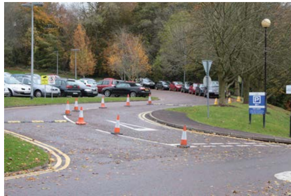
Entrance to the Visitors' Car Park at Parliament Buildings

Turn right at this mini roundabout, taking the third exit. The visitors' car park will be on your left hand side just after you pass through the mini roundabout. There will often be security guards at the entrance to this car park and they may ask you where you are going to. When the Assembly is in session the car park will often be full during peak periods and you will be advised to park elsewhere, such as on the Prince of Wales Avenue.