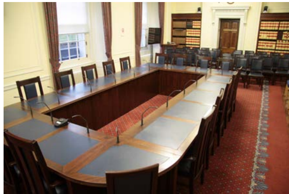
A Committee Room

printed for you in a suitable format. It may be useful to have an autism champion with you on the day as there may be waiting involved as the public gallery can sometimes be full.