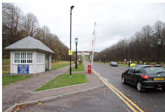
Security Hut and Barrier

At each entrance to the Stormont Estate there is a security hut and a barrier. The security guard at this entrance may ask for identification, so please bring with you a driving licence, passport, ID card or your invitation to an event. You should advise the security guard that you are going to Parliament Buildings.