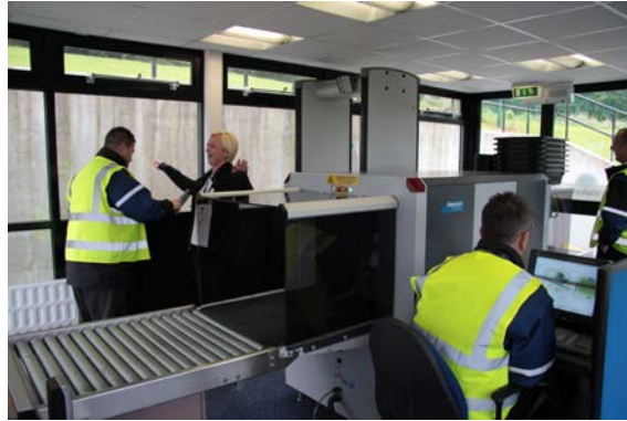
Going through the Search Facility

You will be asked to put your belongings through an X-ray machine – for example, bags, keys, mobile phones, laptops, music players and cameras. You will then walk through an archway similar to those at the airport. Do not panic if the machine beeps as this may be your belt or coins in your pocket. If this happens, the usher will quickly scan you with a handheld scanner.