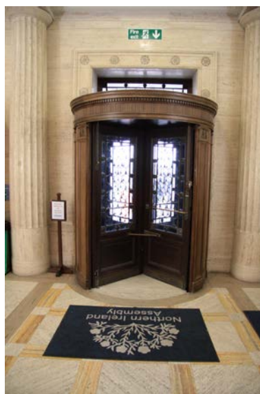
Revolving Doors at Main Entrance

From the search facility make your way to the front of Parliament Buildings where you will enter through revolving doors or via ramps for disabled access.