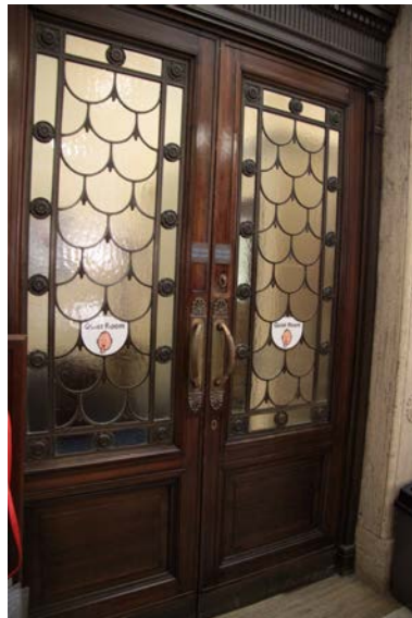
Entrance to the Quiet Room

Behind reception is a quiet room which can be used on arrival or anytime during your visit. You can ask the receptionist for access to the room. There are some items in the room to relieve stress, and there is also a television in the room for watching Assembly and Committee proceedings in a quieter location. There are also a number of welfare facilities throughout Parliament Buildings, including accessible toilets, a changing places toilet, a first aid room and a baby-changing room.