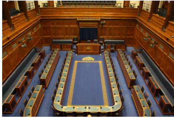
The Assembly Chamber

In the Assembly Chamber visitors are welcome to watch proceedings from the public gallery on the first floor. There are stairs and lifts to the gallery for visitors, and any of our ushers will be happy to assist in arranging access to the gallery for you. You will need to put belongings and mobile phones into a locker before you go into the gallery. You can collect these when you leave.