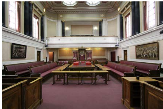
The Senate Chamber

In the Assembly Chamber visitors are welcome to watch proceedings from the public gallery on the first floor. There are stairs and lifts to the gallery for visitors, and any of our ushers will be happy to assist in arranging access to the gallery for you. You will need to put belongings and mobile phones into a locker before you go into the gallery. You can collect these when you leave.