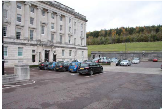
Upper Car Park and East Side Entrance

Further information on visiting the Assembly can be found on the Assembly website: http://www.niassembly.gov.uk/