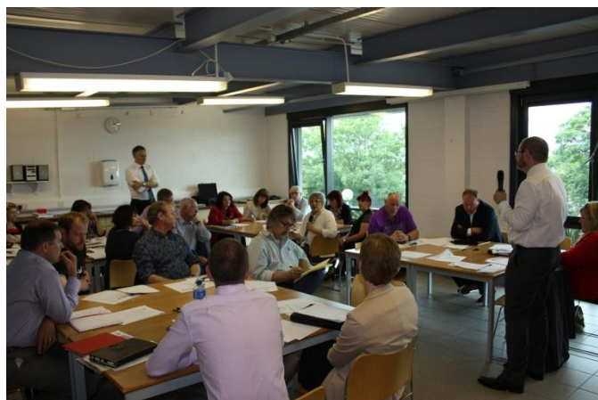
Pictured (I): CAL Committee Members and stakeholders at the Inclusion in the Arts of working Class Communities event at Flowerfield Arts Centre.

Further information regarding the Inquiry, including the full terms of reference and written submissions are available to view at CAL Committee Inquiries