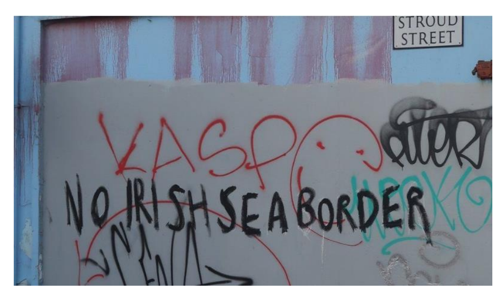
Stroud Street (BBC, 27 Jan 2021) https://www.bbc.co.uk/news/uk-northern-ireland-55827679

APPENDIX 1: Examples of graffiti in Belfast that appeared around Mid-Late January 2021 (taken from Press articles)