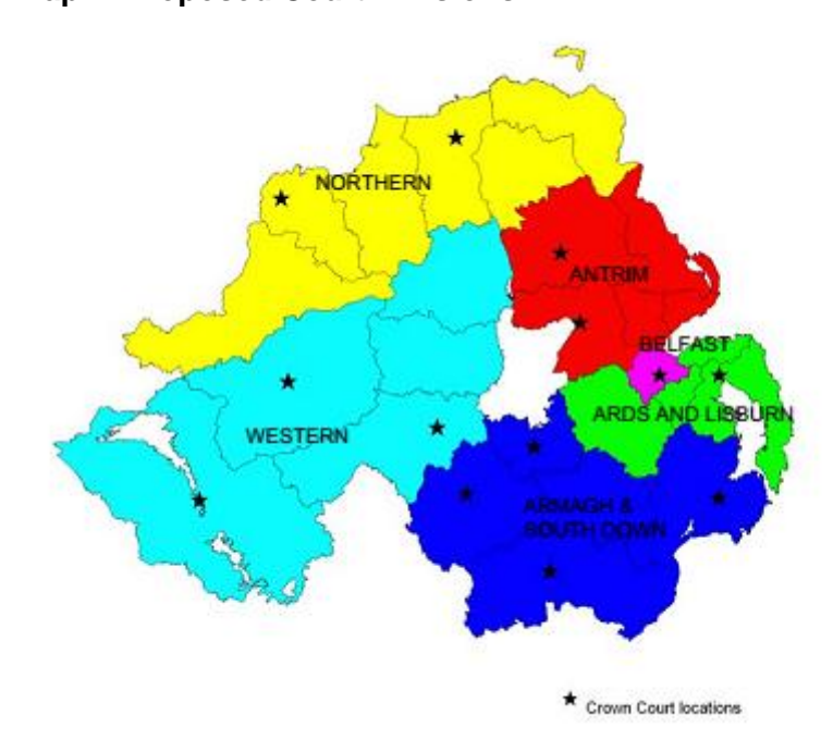
Map 2: Proposed Court Divisions

Clause 3 (1) of the Bill confers a power on the Lord Chief Justice to give directions as to the distribution of business of county courts among the county courts and magistrates' courts and for the transfer of business from one court to another. Clause 3 (4) also confers a power on the Department of Justice to give directions as to the distribution among the chief clerks and clerks of the petty sessions of the functions exercisable conferred by any statutory provision on them. This approach diverges from the initial policy thinking in the NICTS policy consultation. The consultation document in 2010 suggested that the responsibility for the administrative framework for issuing the proposed administrative framework could be issued by the Department of Justice with the agreement of the Lord Chief Justice or vice versa. <sup>10</sup>