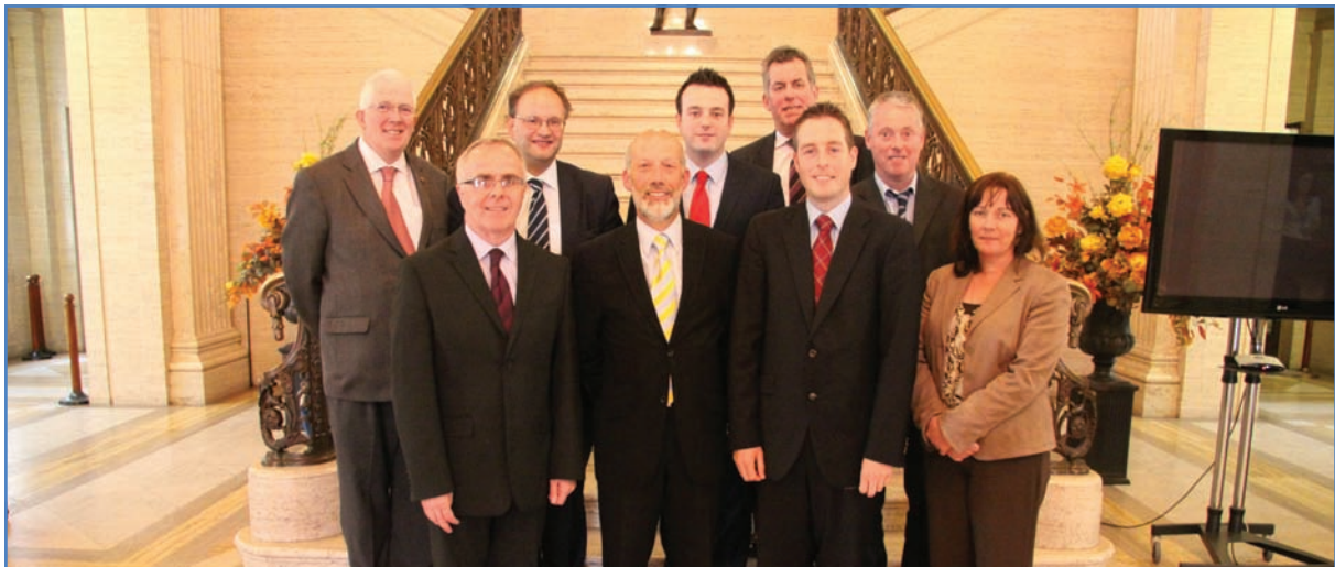
The Committee for Justice is pictured with Minister Ford following its meeting.

“The Committee also took the opportunity to receive an update on the legal aid dispute.”