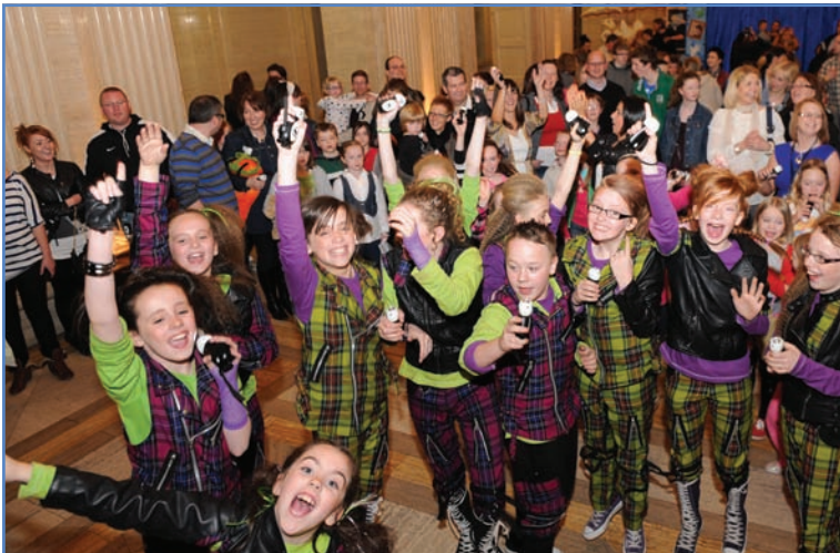
Above - Razzle Dazzle bring sparkle to Earth Hour.

To watch the Earth Hour film of the event at Parliament Buildings go to the WWF Northern Ireland website at ni.wwf.org.uk .