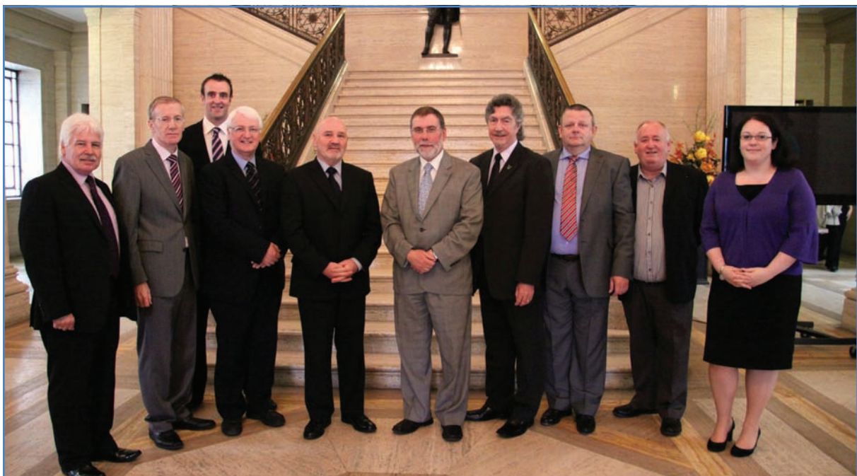
The Committee for Social Development is pictured with Minister McCausland following its meeting.

“We want to ensure that measures put forward by the Department are the best that they can be and will tackle and resolve many serious economic and social issues affecting our local communities.”