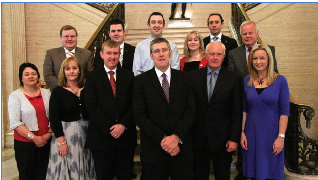
The Committee for Education is pictured with Minister O'Dowd following a meeting in June.

“We will continue to engage with the sector and look forward to working together on the many challenges facing education in Northern Ireland.”