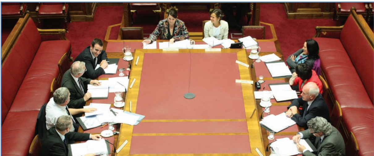
The Health Committee meet in the Senate Chamber.

"This Committee will be looking at health in its widest sense, and we want to look at innovative ways of providing services to people including helping those who care for relatives in the community. This domiciliary care is often unpaid and unrecognised and we need to get this higher up the agenda."