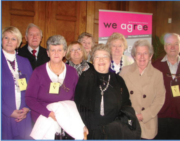
Supporters from Age NI and Age Sector Platform meet MLAs

The final debates on the Older People's Commissioner Bill that took place on 29th November and 7th December, proved to be a big attraction for Northern Ireland's older generation, despite the weather. Supporters of the 'We Agree' campaign led by Age NI in partnership with Age Sector Platform met with several MLAs in the Great Hall beforehand and filled the public gallery to capacity during the debates.