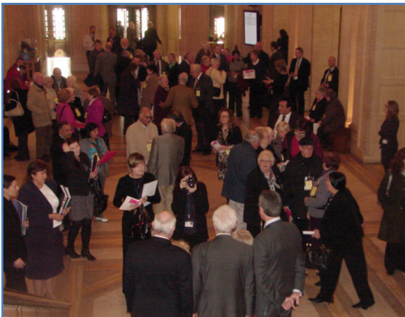
Attendees in the Great Hall before the debate

"There was a real buzz in the air and older people came away feeling that they had been part of an historic event that was a great example of democracy in action. We were delighted to see the passage of the Bill and are especially grateful to the Assembly Outreach team who worked extremely hard to provide easy access for older people during these events and showed great professionalism and hospitality."