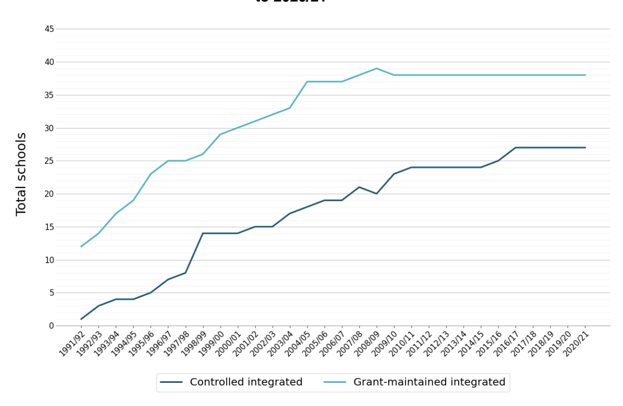
Figure 1: Number of integrated primary and post-primary schools from 1991/92 to 2020/21<sup>56</sup>

Whilst there have been no new grant-maintained integrated schools since 2009/10, a Development Proposal is currently live to establish a new grant maintained integrated school in the Mid-Down area<sup>55</sup>.