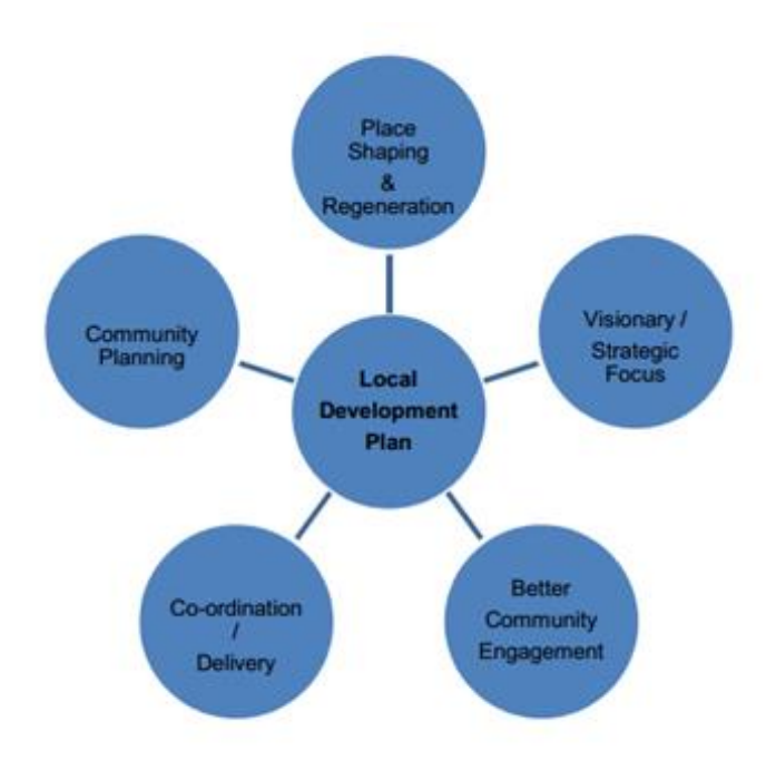
Figure 2: The role of the local development plan

The following diagram illustrates the role of the LDP: