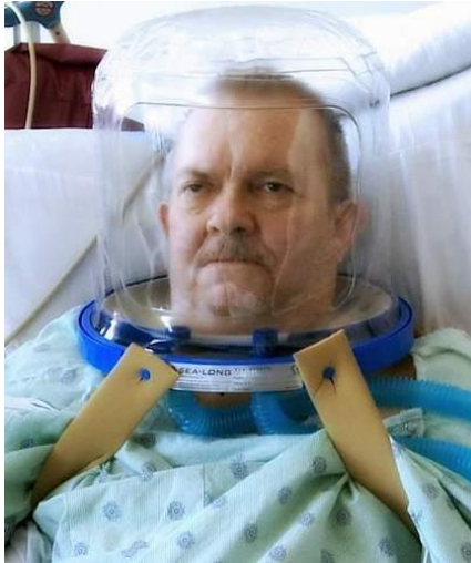
Image 4 non-invasive hood/helmet based ventilation system. 36