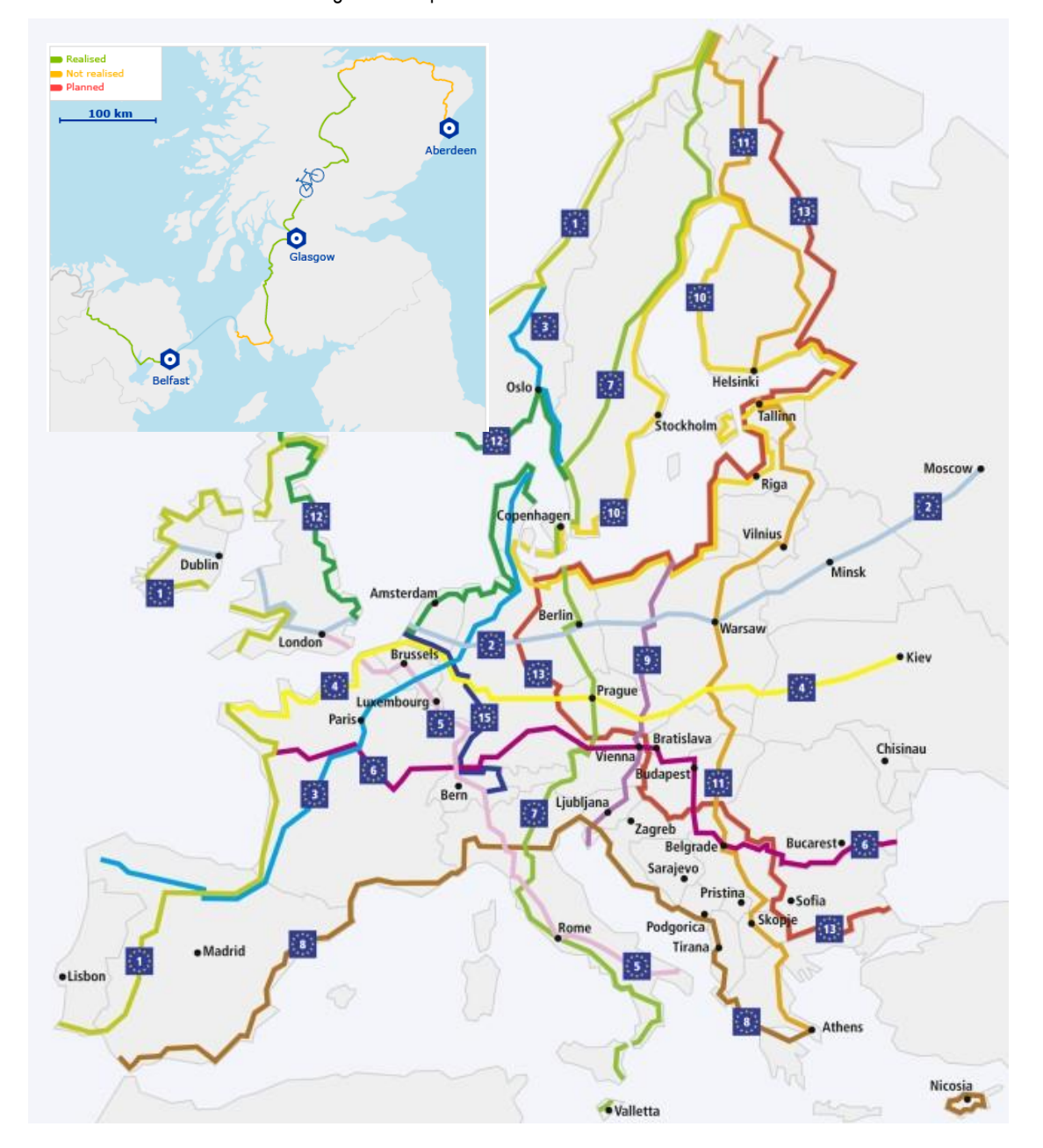
Figure 5: Map of the EuroVelo Network

The main benefits to be derived from the development of the EuroVelo are its potential to: