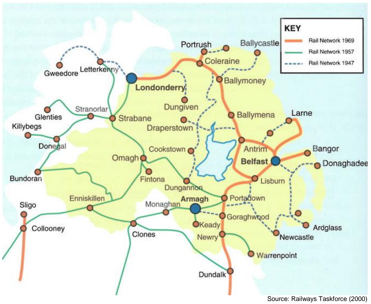
Figure 3: Changes to the Northern Ireland Rail Network Since 1947

The first railways in Ireland were built in the 1830s and by the late Victorian period (around 1900) the railway network in the North of Ireland extended over 1000km and was accessible to within 5miles by approximately 90% of the population.<sup>36</sup> The total route mileage in Northern Ireland following partition (1920) was 754 miles, consisting of 630 miles of 5ft 3in (1,600 mm) gauge and 124 miles of 3ft gauge.<sup>37</sup> The development or rather dismantling of the network is illustrated in figure 3.