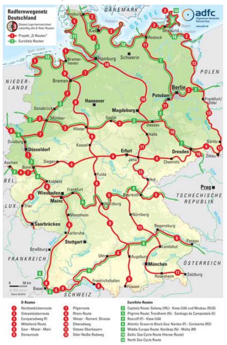
Figure 4: The German Cycle Network

German's national cycle network (D-Routes) consists of twelve routes covering 11,700km. D-routes 1 to 6 run from west to east whereas D-routes 7 to 12 from north to south, connecting existing long distance bike paths.