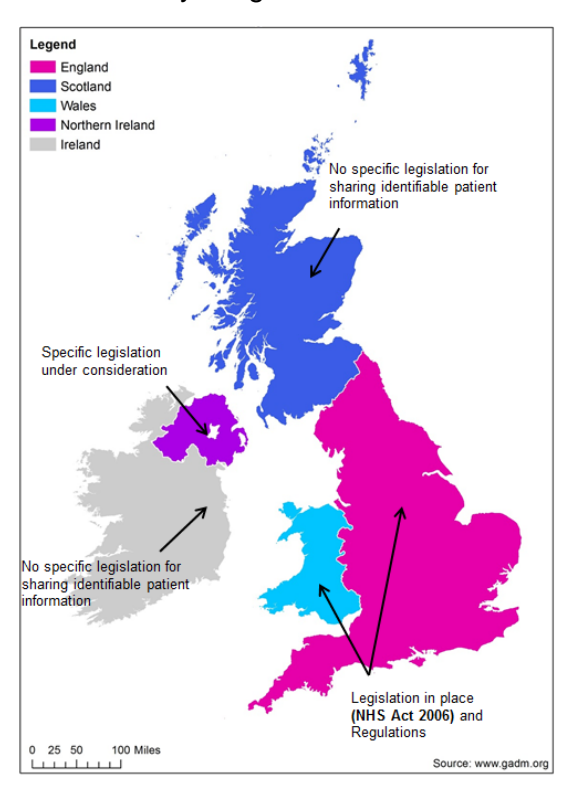
Figure 4. Secondary use legislation – UK and ROI

The final section of the paper examines the current situation in relation to secondary use personal identifiable information in the rest of the UK and Republic of Ireland (ROI) (Figure 4) all of which have data protection, human rights and common law duty of confidentiality obligations.