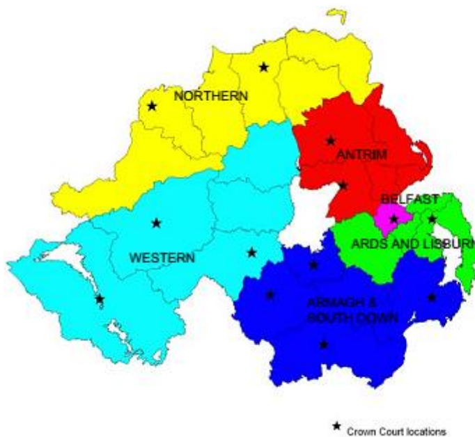
Map 2: Proposed Court Divisions

Clause 3 (1) of the Bill confers a power on the Lord Chief Justice to give directions as to the distribution of business of county courts among the county courts and magistrates' courts and for the transfer of business from one court to another. Clause 3 (4) also confers a power on the Department of Justice to give directions as to the distribution among the chief clerks and clerks of the petty sessions of the functions exercisable conferred by any statutory provision on them. This approach diverges from the initial policy thinking in the NICTS policy consultation. The consultation document in 2010 suggested that the responsibility for the administrative framework for issuing the proposed administrative framework could be issued by the Department of Justice with the agreement of the Lord Chief Justice or vice versa. 10