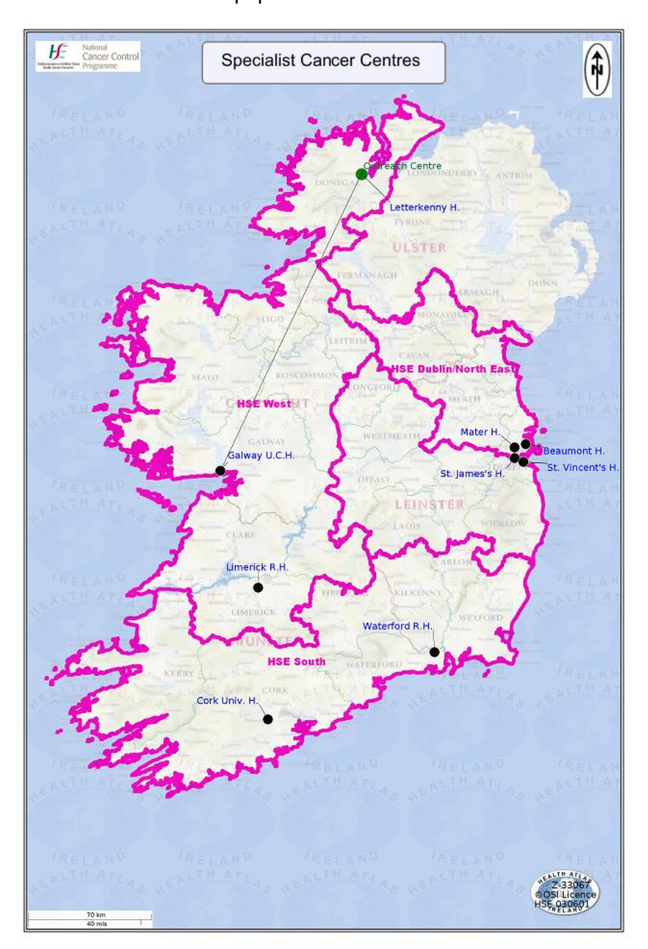
Figure 2. Cancer centers in the Republic of Ireland.<sup>77</sup>

in Altnagelvin Hospital or Belfast City Hospital in Northern Ireland which is discussed further in section 6 of this paper.<sup>76</sup>