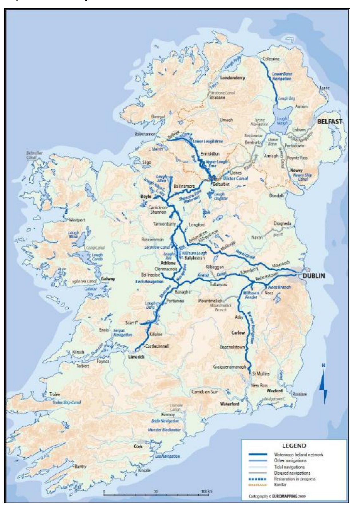
Map no.2 - Waterways Ireland